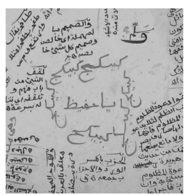
Fig. 2 MS Addis Ababa, IES 5513, f. 4r, detail; photo courtesy of Steve Delamarter.